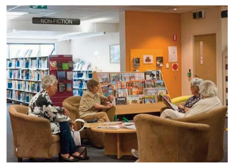
What do want to see at the Guyra Llbrary? Now is your chance to have your say

De cluttering is a trendy thing to do and it's amazing what you find when you get around to cleaning out various hidey holes. Most of the stuff I've uncovered has only been of mild interest. The