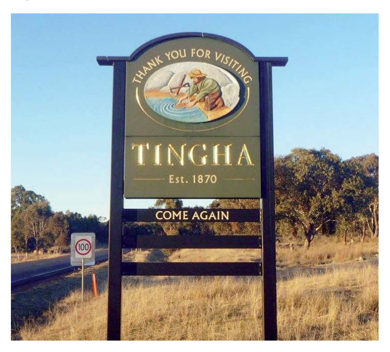
The end of an era with Tingha becoming part of Inverell Shire

The boundary change proposal was the subject of a 2016 petition by the Tingha Citizens Association Incorporated (TCAI) to alter the former local government area of Guyra to transfer the township of Tingha