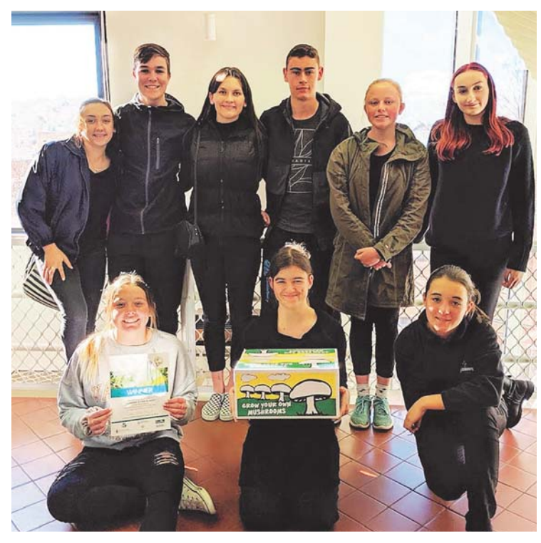
Guyra Central School's newly formed drama troupe were trumphant against some stiff competition from much larger schools from the Armidale region and surrounds'.

The impromptu topic is provided on the day and students then have about 45 minutes to prepare their performance based on the topic provided. The teams may bring 1-2 props with them to use and their performance must be between 3-5 minutes in length. Both teams from our school produced original and innovative productions