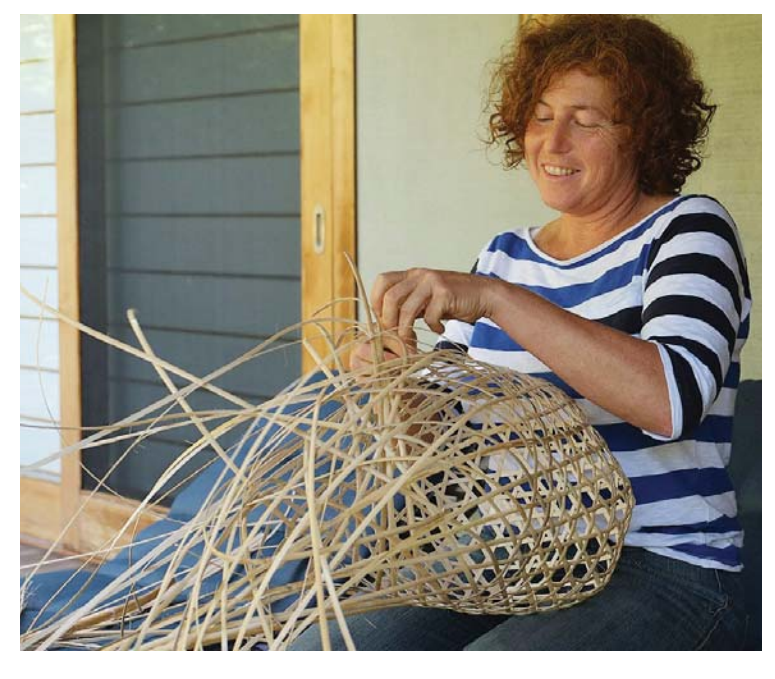
Zimmi Forest will conduct a workshop at My Rural Retreat next week

"We'll be using natural fibres, jutes and materials such as Guinea Fowl feathers and berries to make a beautiful wall hanging, it's going to be a lot of fun," Tina