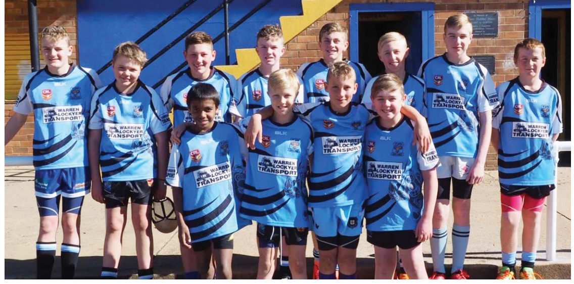
Guyra Central School Under 13s Rugby League team defeated Gulargambone and will compete in the finals of the Country Cup State Championships

Working as a team and with exceptional sportsmanship, the team defeated Gulargambone 54-8 and will now travel