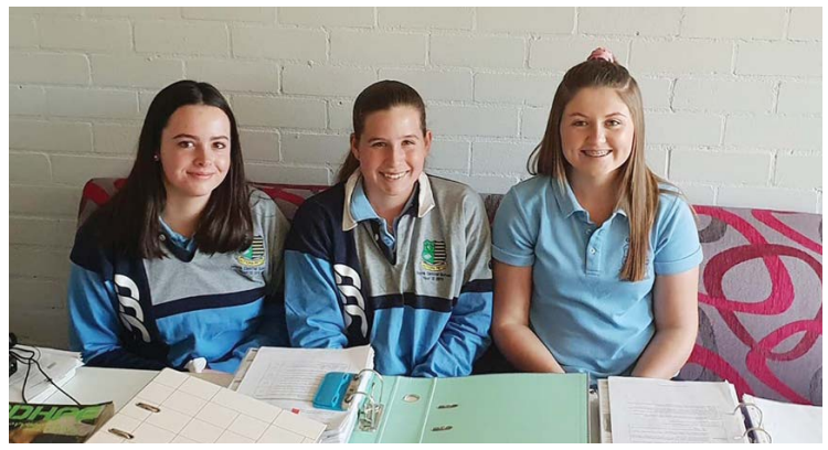
Senior students are enjoying their new study area

The current year 11/12 students spent time with supplier, ABAX Kingfisher, selecting fabrics and designs for the new area. The suppliers were so im-