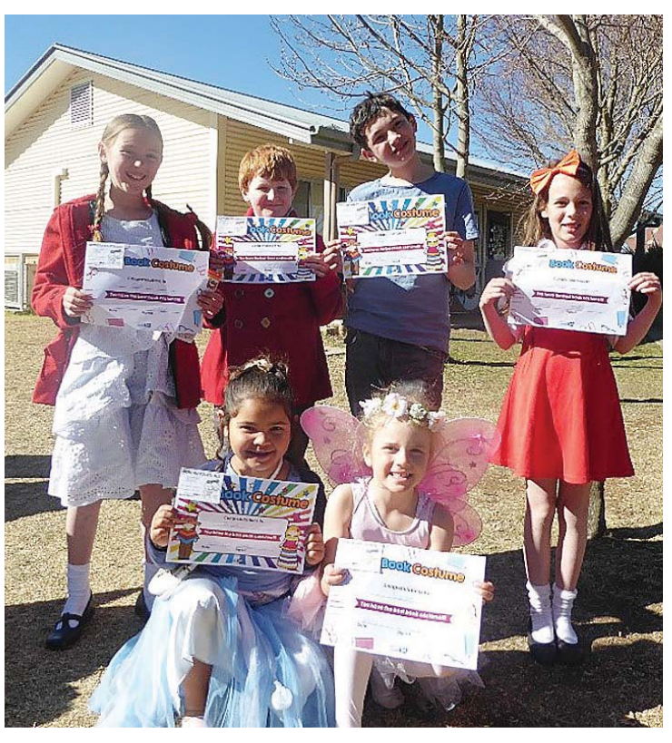
Black Mountain students dressed up for Book Week

and colourful books on display that Scholastic Books provided. Some students were lucky enough to have a voucher to spend as their prize