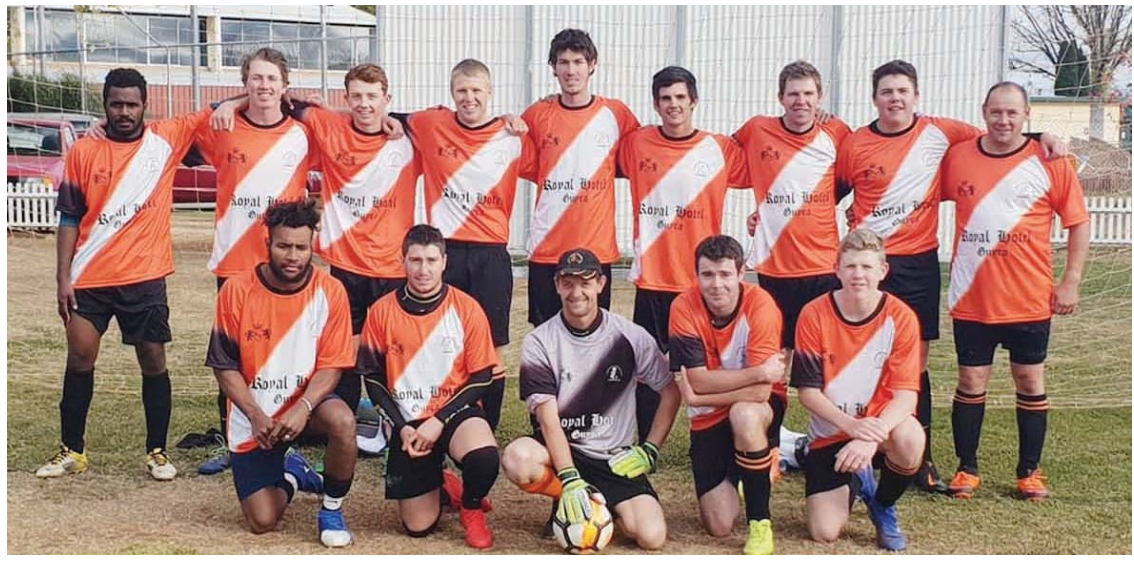
Caspers first grade will be hoping to secure on grand final spot this weekend

their heads and went to the break 1-0 down. They got their composure back at half time and were keen to keep up their attack and come away with the points.