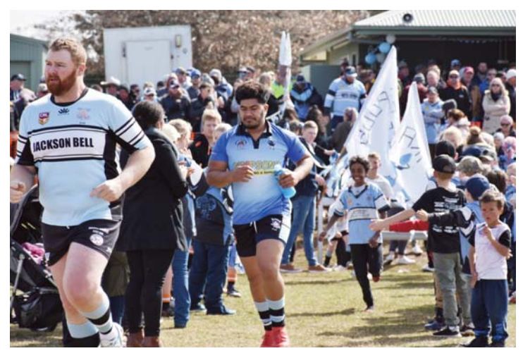
If you want to see the Super Spuds on the field this year now is the time to step up by joining the committee

The Guyra Rugby League Club has been inundated with enquiries from potential players for the 2020 season and could field up to three teams in the Group 19 competition.