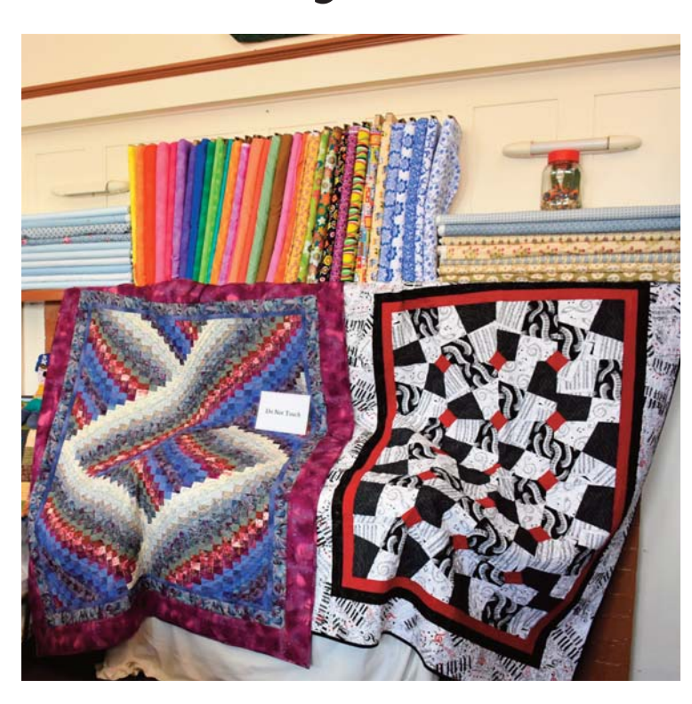
Quilts and art are on display at the RSL Hall in Bradley Street