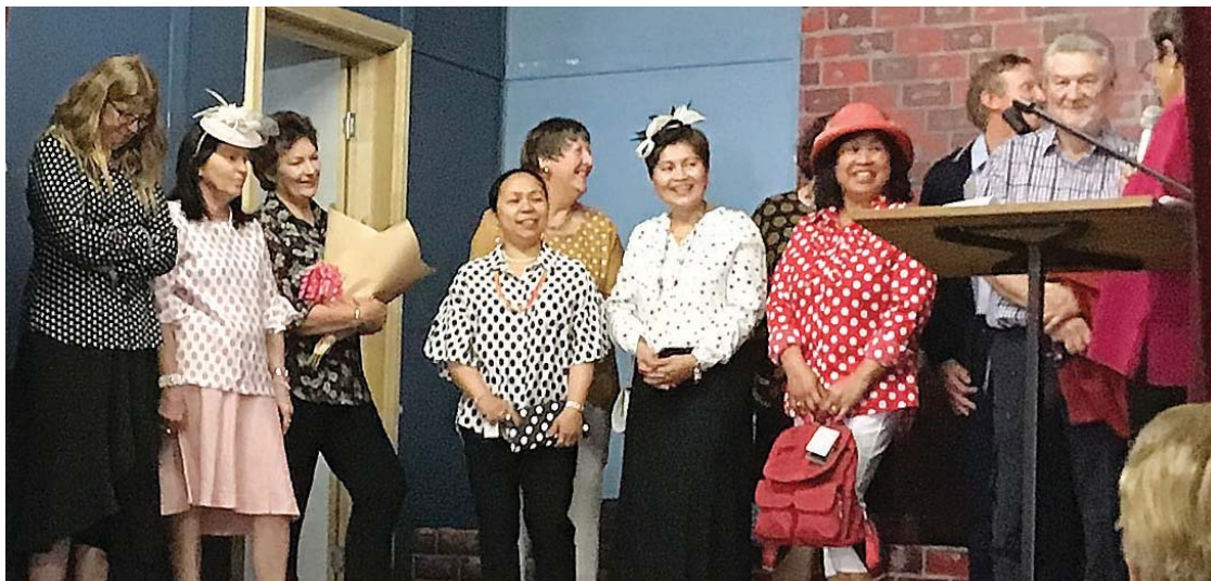
Spots were the must have fashion at this year's Ben Lomond Fashion Parade