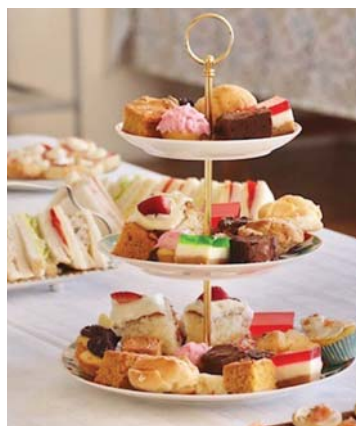
A delicious High Tea was enjoyed by guests who also enjoyed the participation of some brave (and stylish) male models