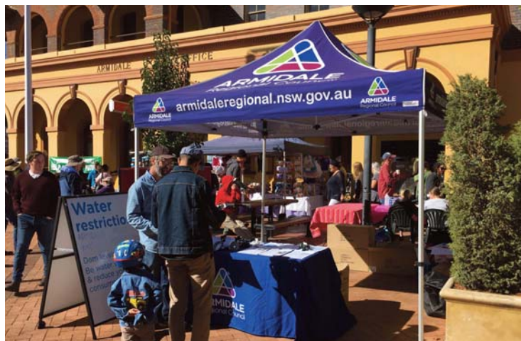
Learn new ways to save water at this Sunday’s Markets in the Mall

Many of the water-saving products available from local stores will be on display, alongside information about water rebates and other steps households can take to be water