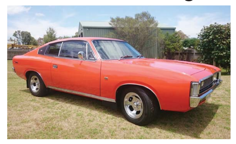
If you enjoy old cars such as this Charger, you can check them out this Sunday at the NAB car park

The Guyra and District Automotive Club will be having a Cobweb Run on Sunday December 8th.