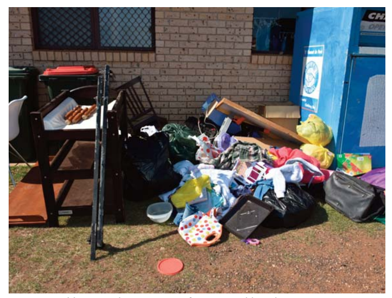
Vinnies volunteers are often greeted by a huge mess outside the store when they arrive

And save them the trouble of cleaning up your mess by disposing of the rubbish where it belongs.