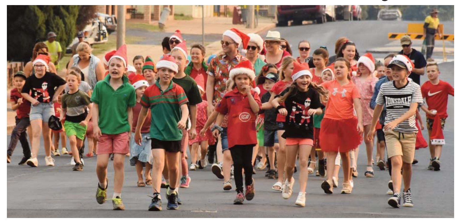
A colourful Christmas Parade marked the start of the annual Christmas Party held in Bradley Street on Firday

The Guyra Christmas party which was held on Friday night attracted a large crowd with an estimated attendance of around 1000 to kick off the festive season.