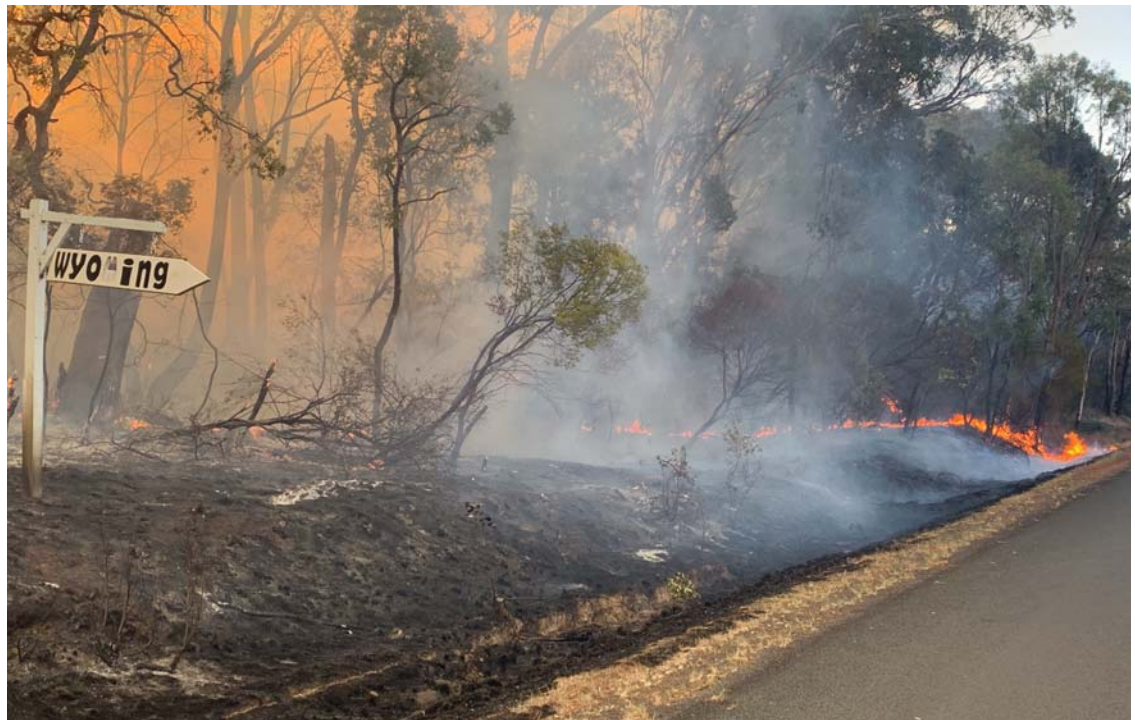
The fingerboard which survived the fire that burn all around