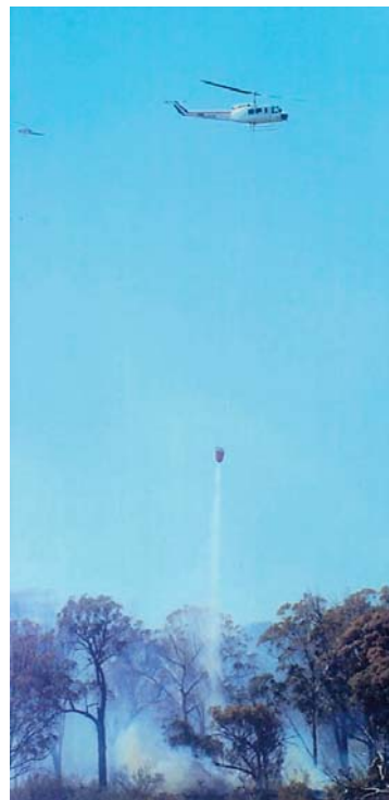
Water Bombing helped to save Wyoming and other properties

Did we have a Bush Fire Survival Plan? Two big green tanks kept full of water (pumped from above when necessary). One pump in the house for the western side of the house/garden and one pump in the rockwork for the eastern side - both with extended hoses. BUT no power