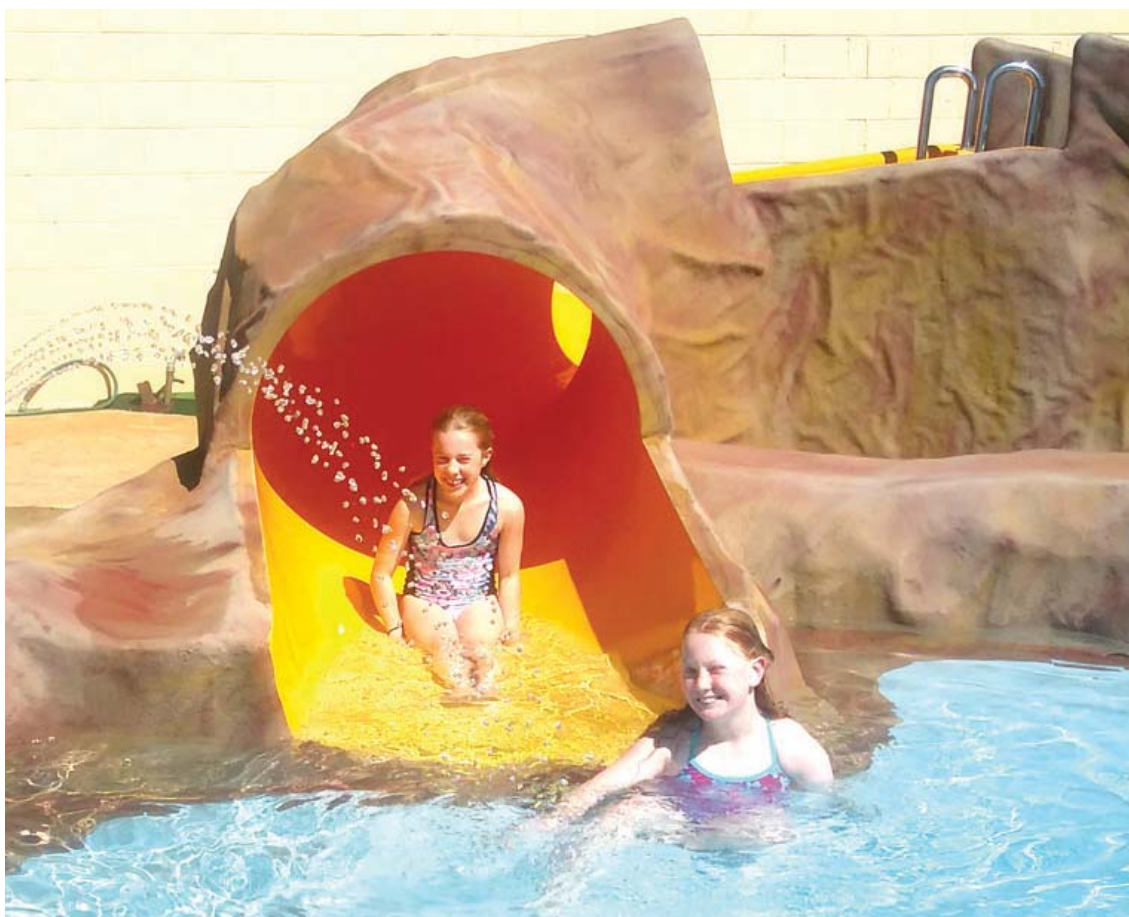
There have been a lot of changes to the Guyra Swimming Pool since its was first opened in 1970

"Guyra Pool has been a tremendous community asset for many years and continues