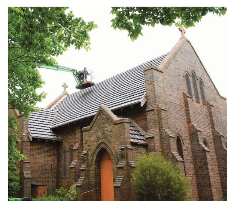
Contractor Steve Grant undertaking stage 2 work on the Anglican Church roof in 2018

The first two stages of the repairs have been carried out over the last few years by the contractor S & DC Grant from Glen Innes. Stage 1 was to remove all the lichen from the Terra Cotta tiles to enable the identification of all broken tiles. Stage 2 involved the re-