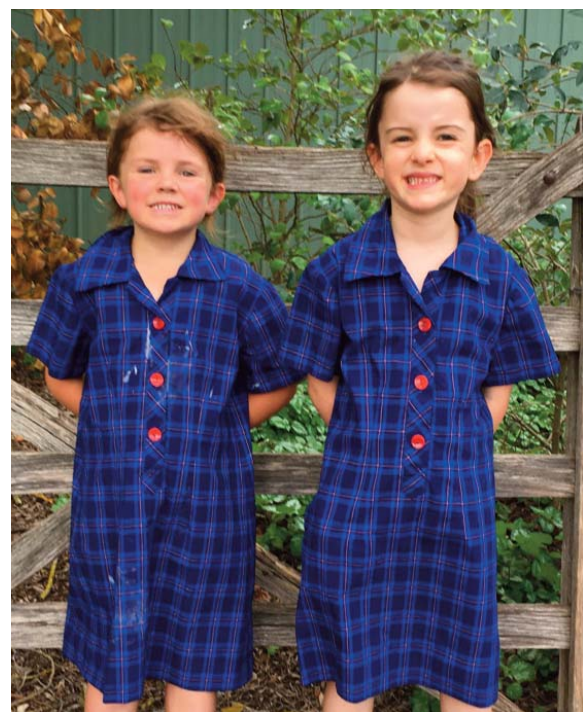
Bald Blair Public School