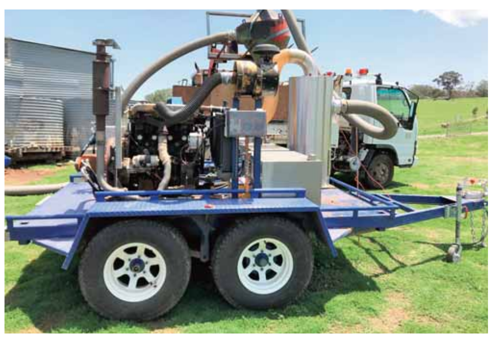
A mobile solution to a common on-farm problem - a trailer mounted vaccuum

Once the fallout is cleared, an assessment can be made of the sheds foundations and repairs and restumping carried out if needed. Rod expects demand to increase due to people moving