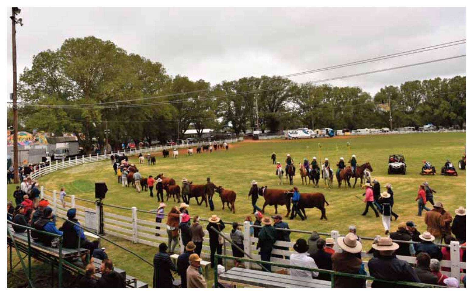
The 2020 Grand Parade