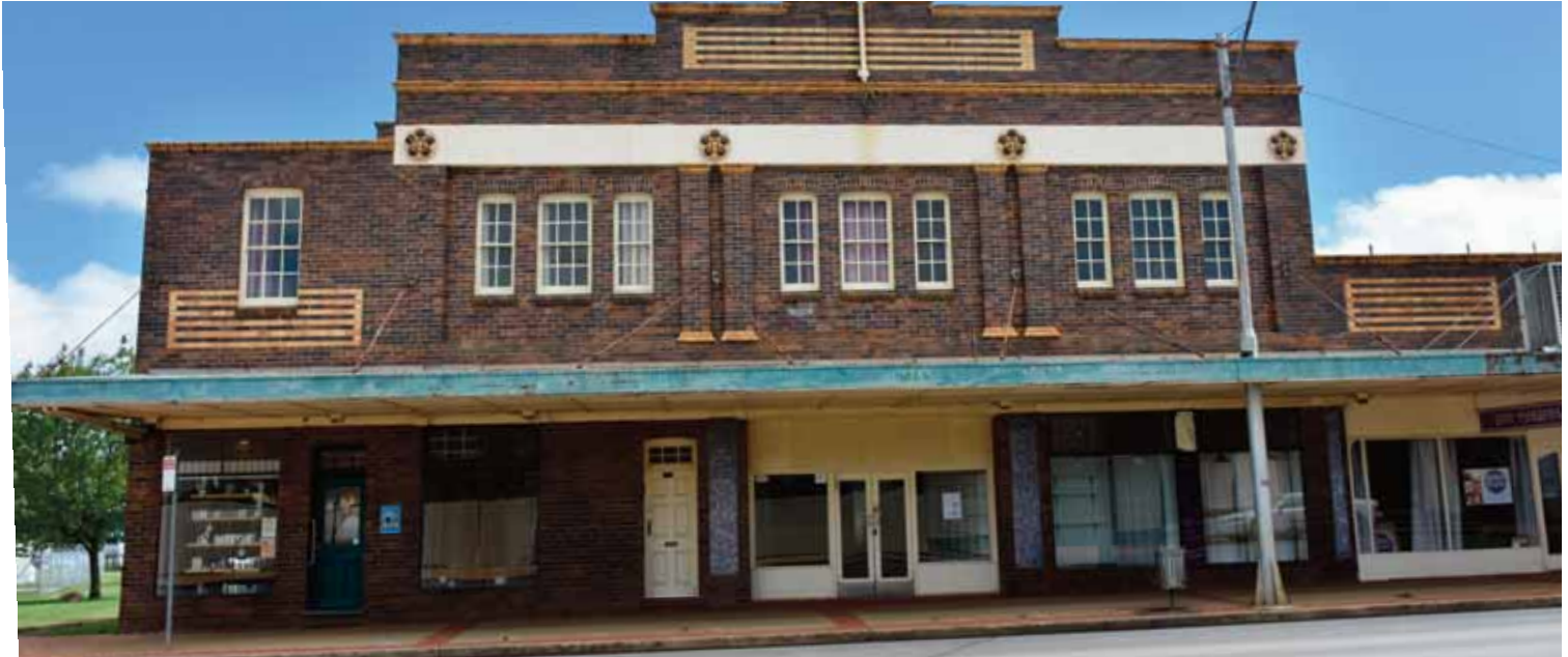
Could Guyra be the home of a 'Hall of Fame' for Australian poets? One man has grand plans for the building

A budding entrepreneur with a penchant for poetry has unveiled grand plans to turn Guyra's Arcadia Theatre into a home for Australian poets.