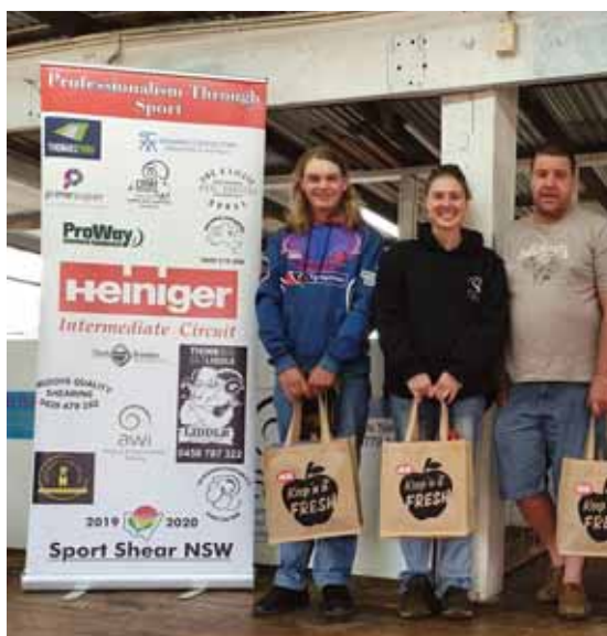
Novice Final (above) l to r: