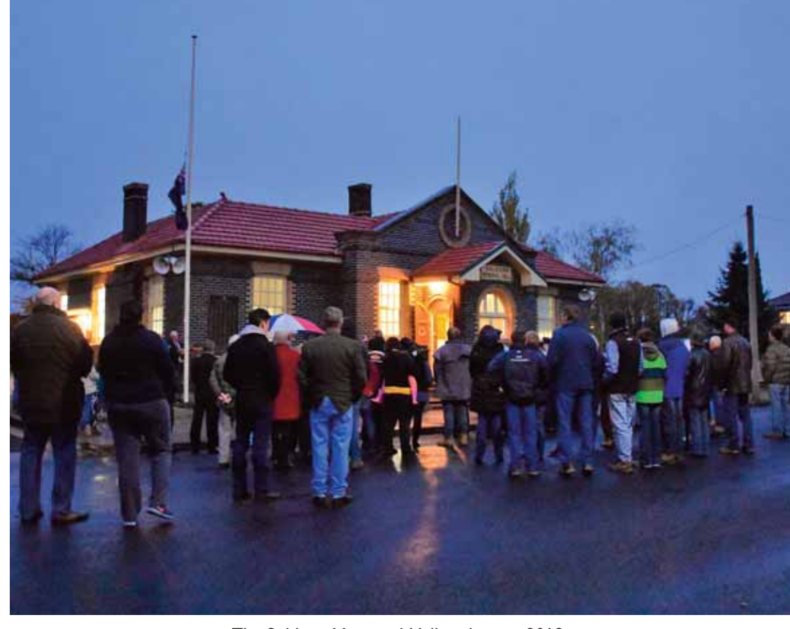
The Soldiers Memorial Hall at dawn in 2018. Services have been suspended this year due to COVID-19 restrictions

From there most of you have found your spot outside the cenotaph located at the Guyra War Memorial Hall while the beautiful ANZAC service is conducted with many of you laying wreaths. Over recent years this ceremony has attracted many hundreds of participants. For the War Widows and their families this will be a particularly difficult day - we know you are used to gathering together with other townspeople to honour your husbands