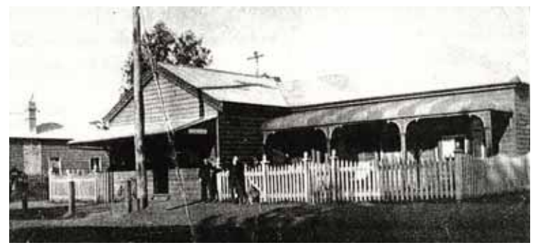
Post Office 1909 opposite Guyra Shire Council Chambers.

With the arrival of the Railway in 1884 the Post Office was transferred to the Railway Station.