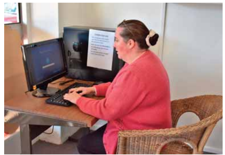
If you need access to a computer, you will find one available for public use in the foyer at GALA. Staff can assist if necessary