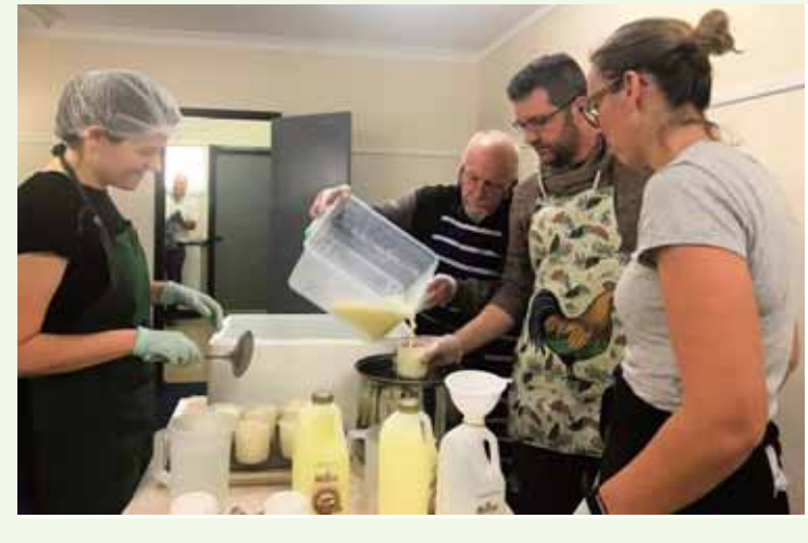
Cheese making earlier this year at NECC Armidale. Anyone interested in booking in for a cheese course give us a call. Also interested in running wax wraps, candles, painting, lead lighting, cake decorating and cooking. All ideas welcome.

available for participants. If you have trouble reading manuals and completing multiple choice tests this is the course for you. Courses will run in three 3 hour sessions per week for two weeks (18 hours of training).