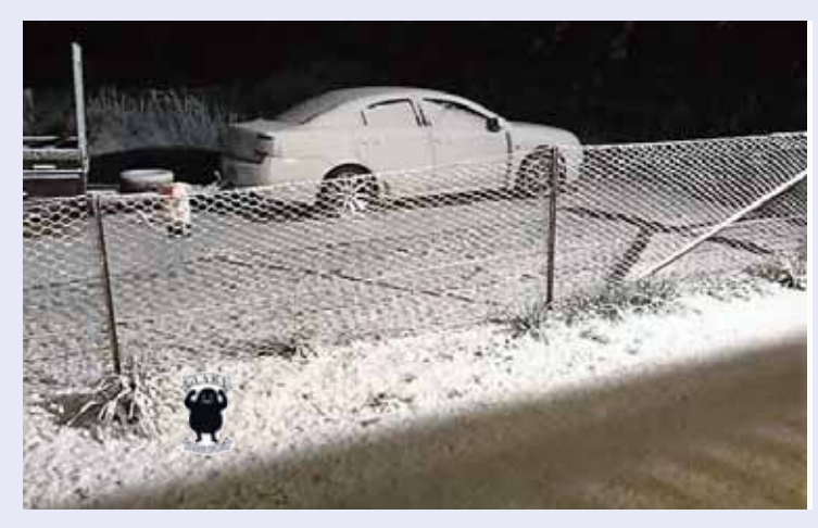
Snow at Ben Lomond on Monday evening

There were reports of around 2 to 4cm of snow settling shortly after dark at Ben Lomond. Most of the snow fell between 6pm and 7pm and further falls predicted for Tuesday did not eventuate.