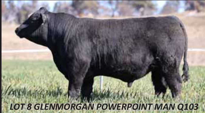
LOT 8 GLENMORGAN POWERPOINT MAN Q103