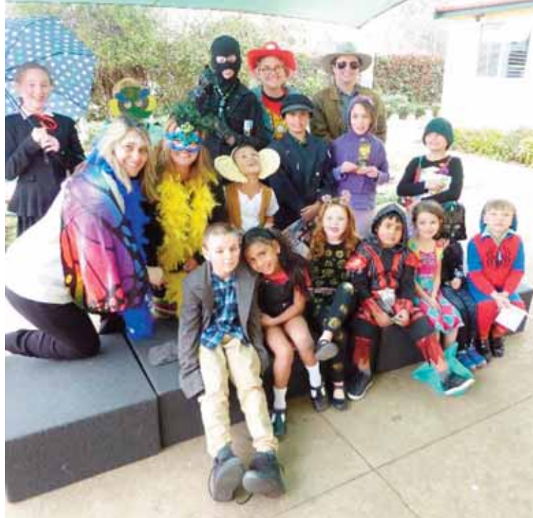
Black Mountain Public School students enjoyed dressing up as their favourite book character for Book Week