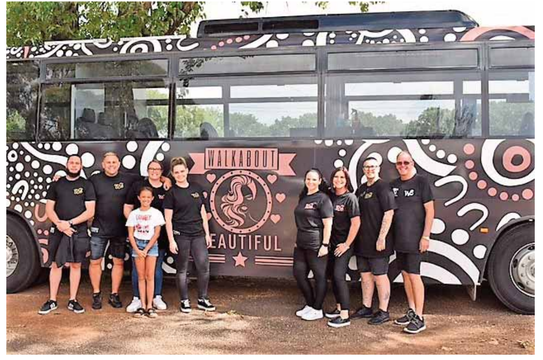
The team from Walkabout Barber Enterprises were kept busy throughout the day providing haircuts and beauty services

Lunch time was busy with all the families lined up for the free sausage sizzle, drinks and icy poles. After lunch we kicked off with the Group 19