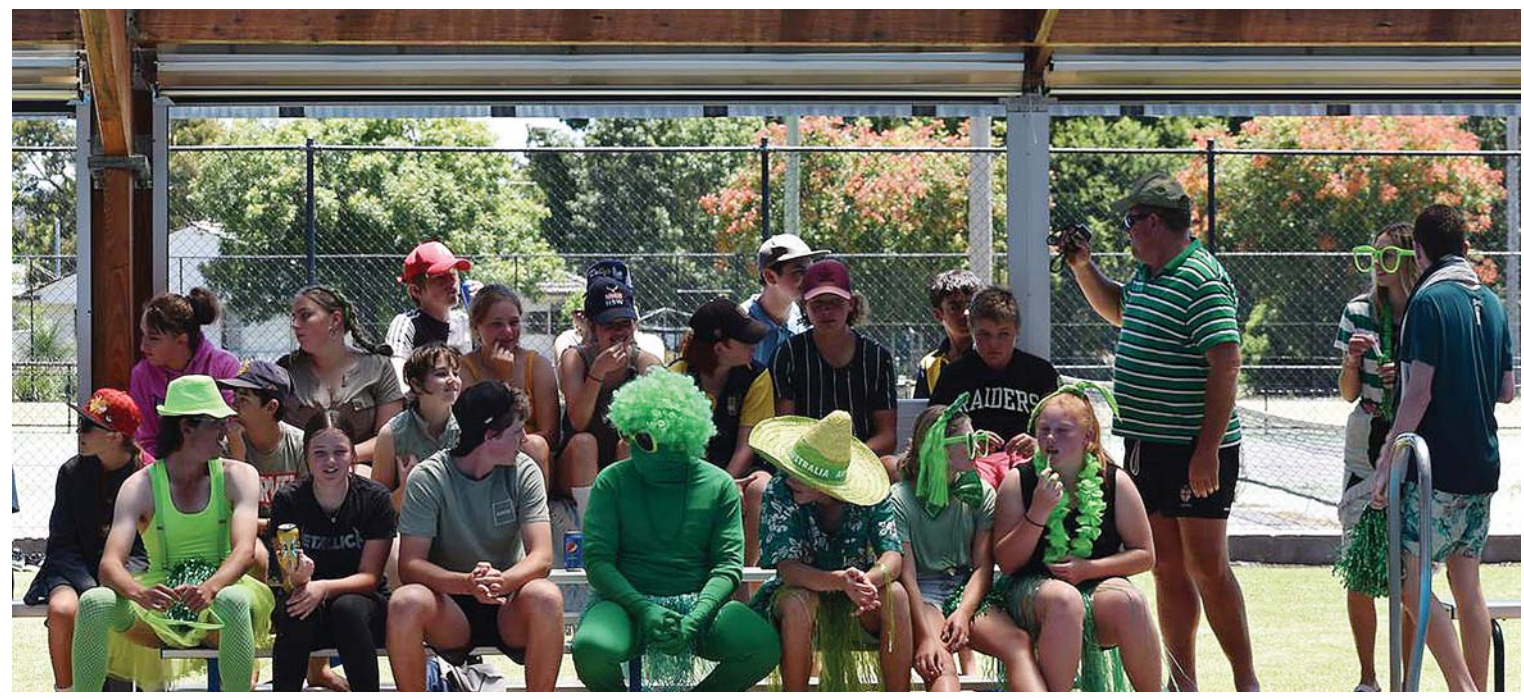
Above: Chandler achieved Most House Points Below: Malpas was seond in the House competition, followed by Nincoola, 3rd

On the fine summer's day of Wednesday February 10, Guyra Central School held their secondary swimming carnival. It was outstanding to see the participation and sportsmanship displayed, with most students entering in a race and substantial support from the sideline.