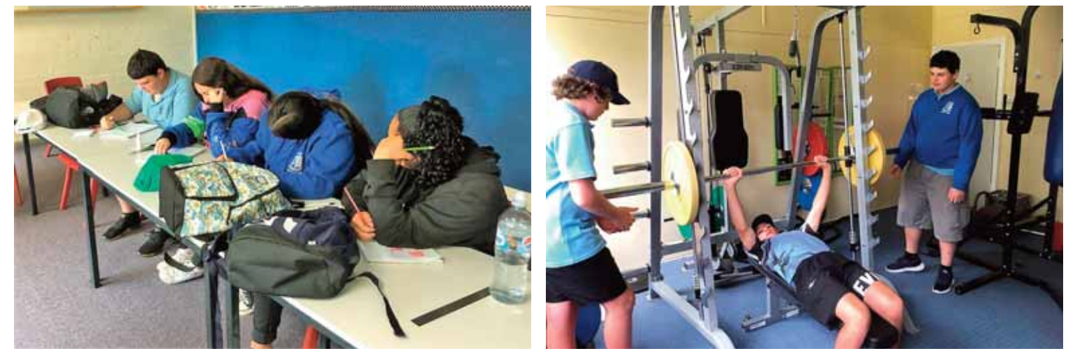
Without the distraction of mobile phones students are less distracted in the classroom and playground behaviour has improved

"Students are communicating with each other and there has been an increase in participation in recreational pursuits and physical activity in the playground.