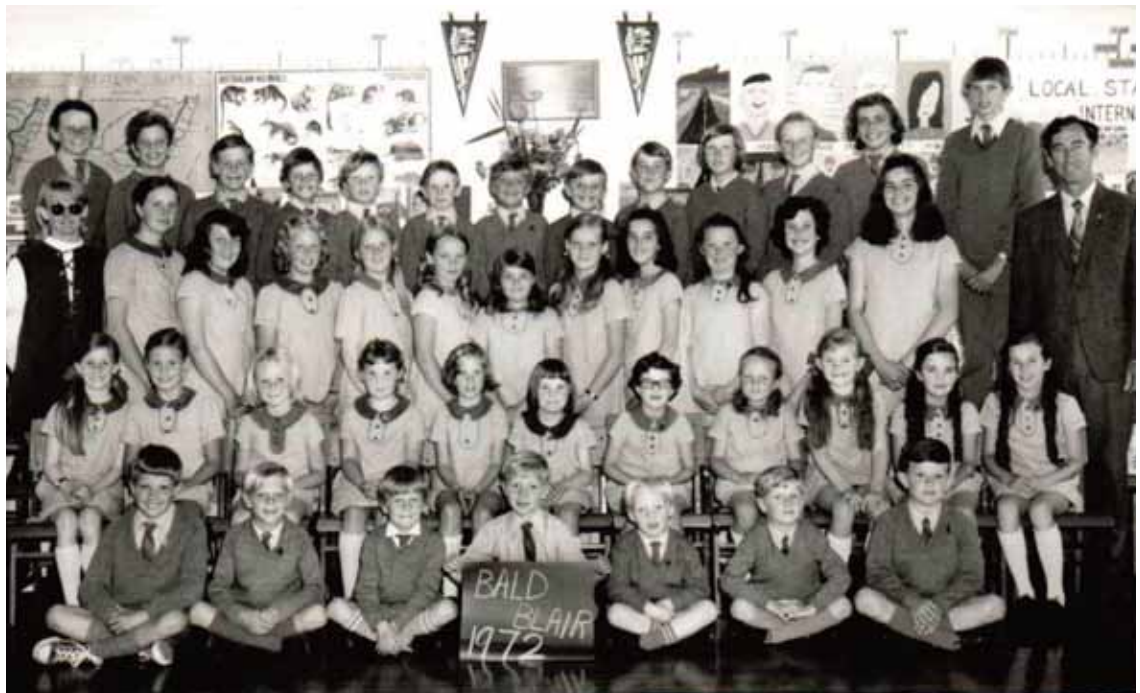
Bald Blair Public School 1972 - Can you spot a familiar face?

The organising committee are looking forward to receiving