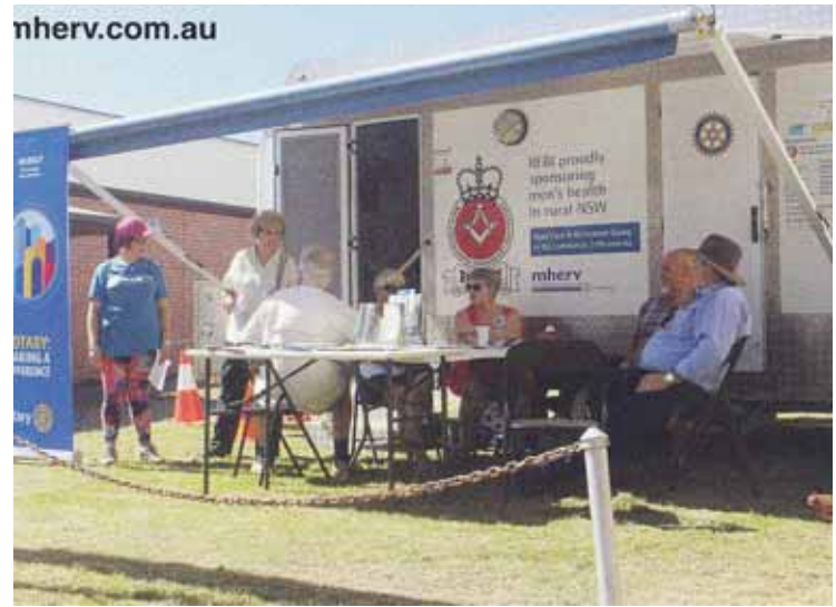
The Men's Health Education Rotary Van (MHERV) will be in Guyra on Friday and Saturday this week