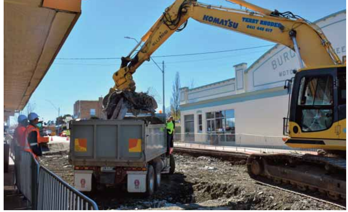
Three weeks after beginning work on Bradley Street, workers have started excavating again

"As expected, excavation works revealed the subgrade was not suitable to construct the new road. Council carried out works to strengthen the foundation, but were not satisfied that it would meet the required standards and the needs of the community.