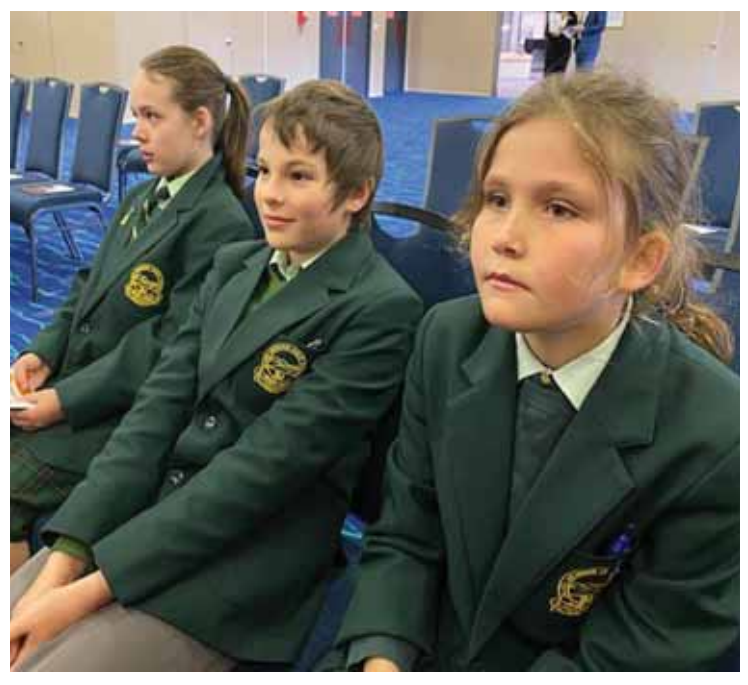
Black Mountain School Leaders