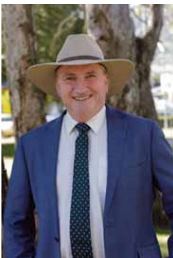
Member for New England Barnaby Joyce announced the grant this week

"This grant will help drive down energy costs down through better insulation at the premises to ensure that