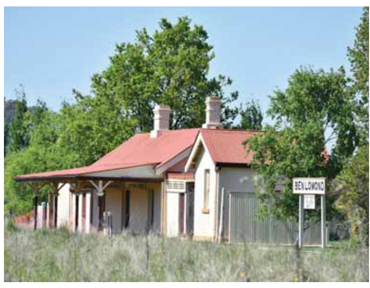
Ben Lomond Railway station is set to become a launch pad for cyclists with funding announced to construct Stage One of the NE Rail Trail

"The rail trail will revitalise this asset and generate economic growth through increased tourism, providing a