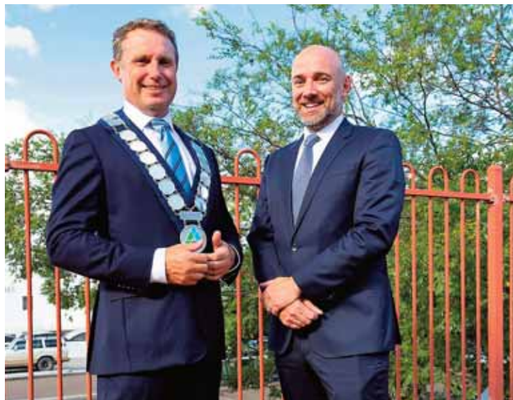
Newly elected Mayor Sam Coupland and Deputy Todd Redwood

The new Mayor of Armidale Regional Council is Cr Sam Coupland who defeated former deputy Mayor Cr Debra O'Brien 8-3 following a show of hands last week. The deputy Mayor will be Todd Redwood who also defeated Cr O'Brien 8-3