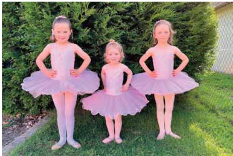
Guyra dancers of all ages enjoyed the chance to perform in 2021