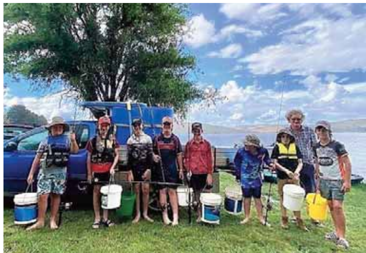
An example of the great support received at Malpas Dam.

The end and beginning of years gave Guyra Anglers Club the opportunities to fulfill one of their main aims – restocking the local waterways with Cod and Bass.