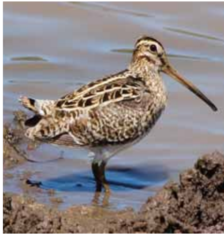
Latham's Snipe gallinago hardwickii

Latham's Snipe, also known as the Japanese Snipe, a medium-sized, long-billed, migratory snipe of the East Asian-Australasian Flyway," Dr Debus said.