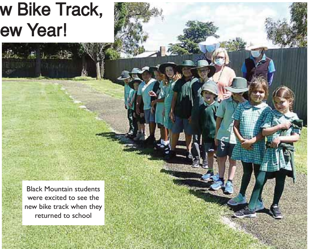
Black Mountain students were excited to see the new bike track when they returned to school