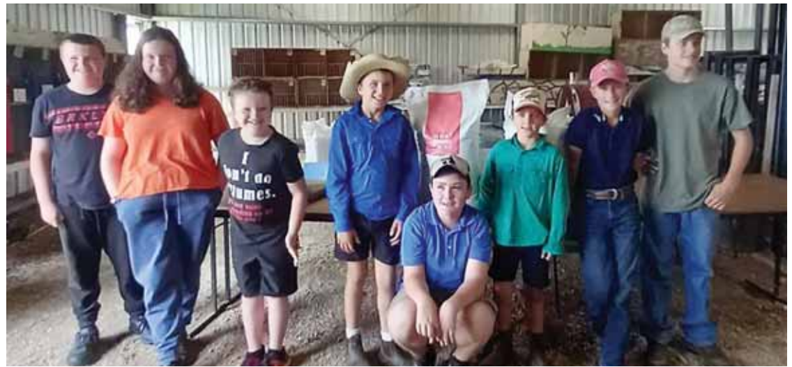
Junior Exhibitors at the Poultry Pavilion