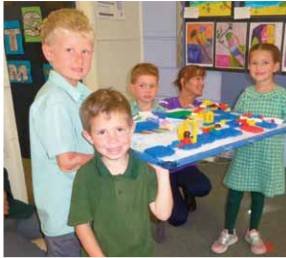
Top right: K-2 students with their lego creation