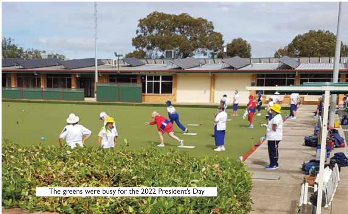
The greens were busy for the 2022 President's Day

The Australian athletics championships will be held in Sydney from 26th March through to 3rd April 2022.