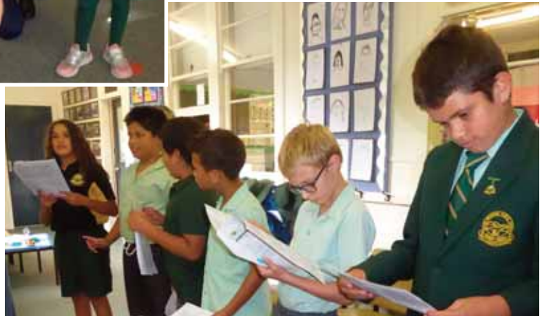
Bottom right: 3-6 Class Presentation

It was lovely to welcome back families to Black Mountain Public School for our first assembly for Term 1 2022.