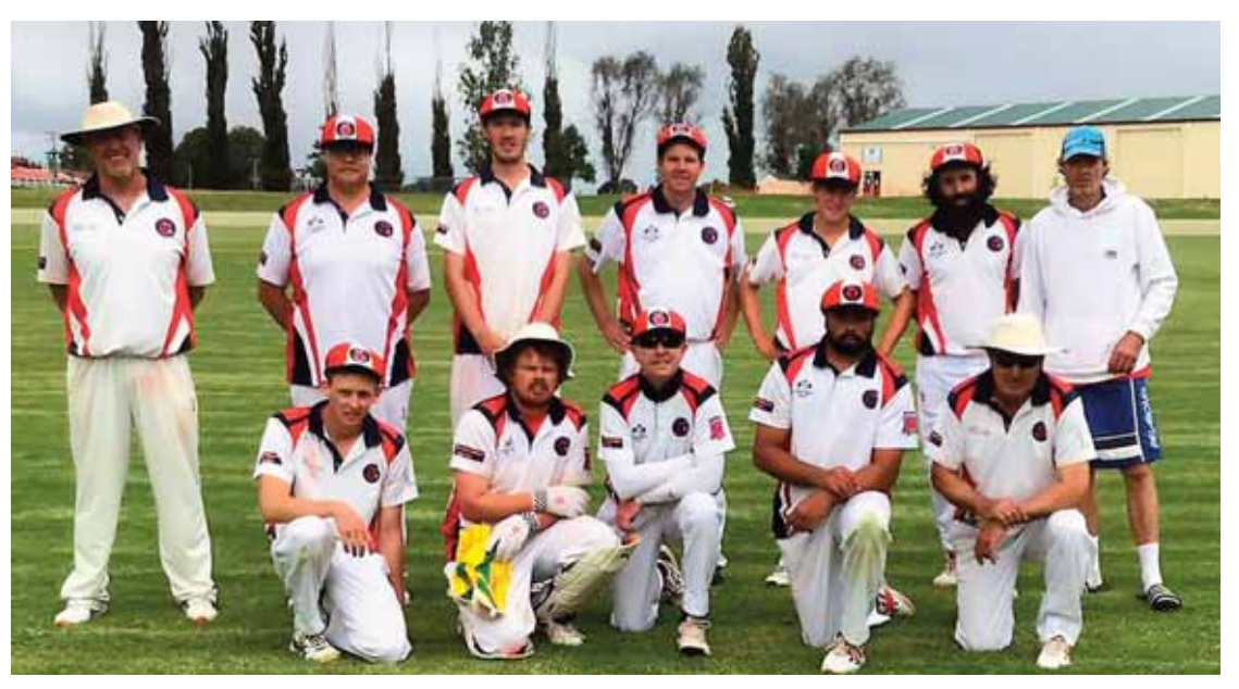
Guyra Ist Grade

Guyra batted first, finishing with a competitve total of 7/90, In reply CSC Easts (3/103) were the better team on the day.