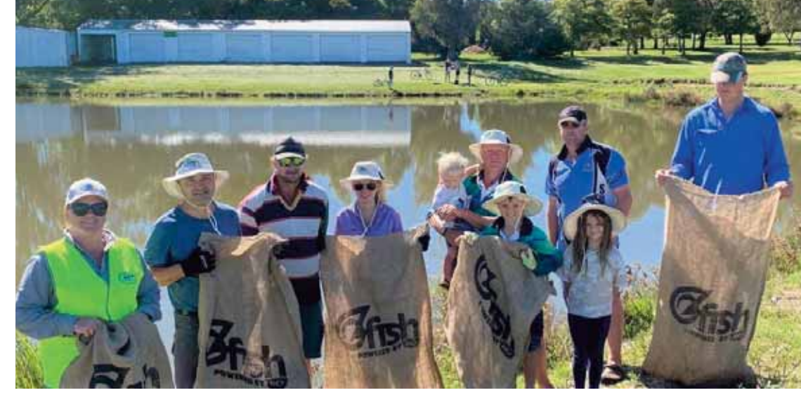
Guyra Anglers Club Members supporting OzFish Wasted Waterways Cleanup at Tenth Dam and Mother of Ducks Nature Reserve on the weekend

Sunday March 20th saw the Guyra Anglers Club members undertake the OzFish Northern Tablelands Chapter Wasted Waterways cleanup day at the tenth dam and Mother of Ducks Nature Reserve. With a small group undertaking the task, we are thankful for their efforts and for volunteering their time. We removed plastic and glass bottles, food packets, and many