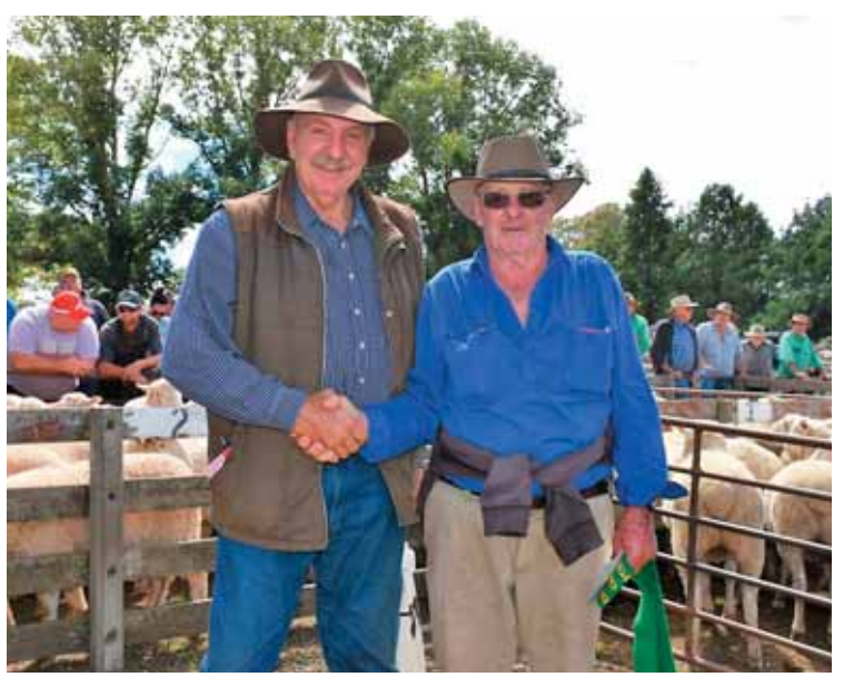
Reserve Champion pen Export Lambs ~ I GVickery & Co