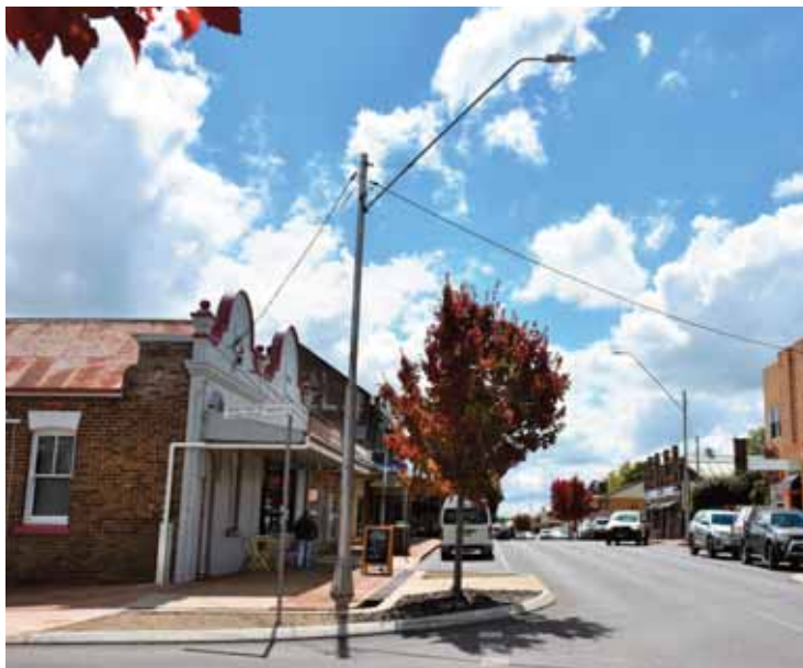
The old steel streetlight columns will be replaced with new composite power poles and streamlined powerlines

"To ensure the safety of the public, their property and Essential Energy crews while this work takes place, traffic control measures will be in place and we ask motorists to