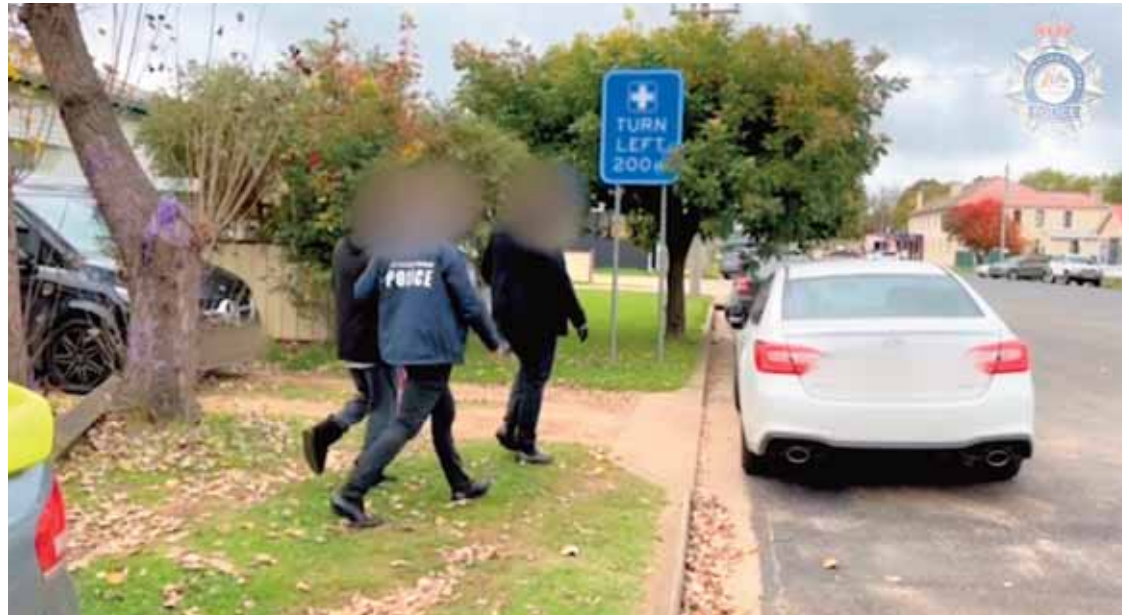
Federal Police arrested the man after searching the Guyra home in April