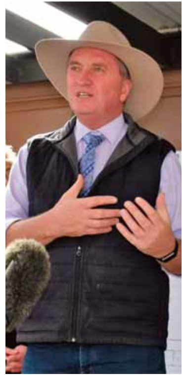
Barnaby Joyce (file photo)

Armidale Regional Council anticipates this project to have a significant impact on the Guyra community through increased employment opportunities, greater access to learning and study environments and the ability to meet higher quality childcare standards.