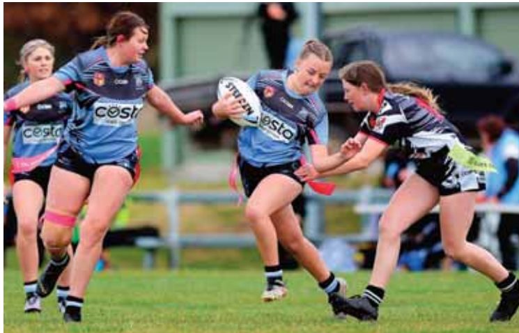
League Tag action Guyra versus Glen Innes

This weekend Guyra will play Moree at home in all age groups