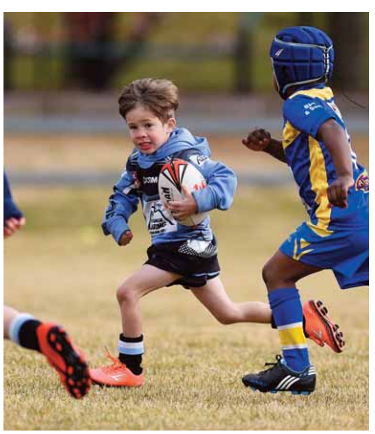
Junior League action against Bingara and Inverell July 23rd