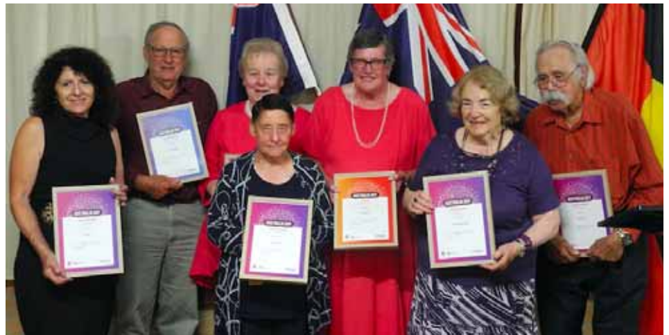
2022 Guyra Australia Day Award winners

For further enquiries please phone Armidale Regional Council on 1300 136 833.