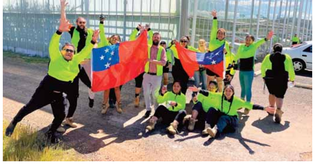
Samoan workers at Costa cheered on their team at the Rugby League World Cup

"We have also continued to provide our healthy tomatoes to numerous organisations and