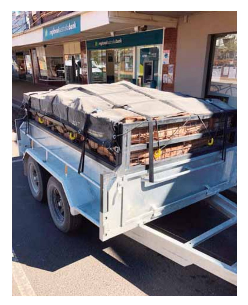
You can support this great cause by purchasing tickets in the monster wood raffle

Tickets will be available at the street stall and are also available from Fourways Service Station. Team Guyra would really appreciate your support.