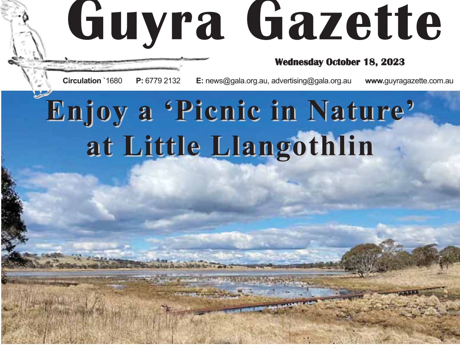
If you love nature why not visit Little Llangothlin Nature Reserve this Saturday

The Guyra Landcare Network and the Ben Lomond Landcare Group, invite you to a 'Picnic for Nature' at Little Llangothlin Lagoon on Saturday October 21st from 10:30am to 2pm.