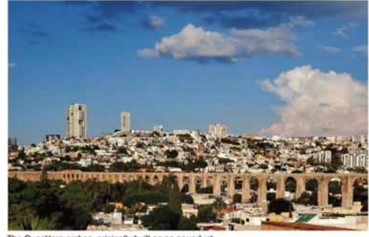
The Querétaro arches, originally built as an aquaduct

We have also had two to three Rotary dinners during the month which were all enjoyable. Because we have had new students arrive I have found them more enjoyable, rather than being the only exchange