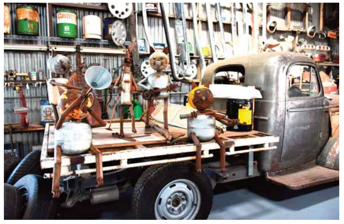
The Cool Cats Band on display in Burgess Garage Car Museum during TroutFest

The committee would like to thank all the businesses that were open as they wanted to bring life to the street to showcase what Guyra has to offer. Thank you to the service clubs and volunteers who assisated - we know it can be tough as numbers are minimal in some clubs.