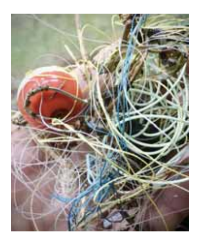
Tangled fishing line and tackle pose a problem for wildlife

The lagoon is home to a multitude of bird species it is the responsibility of all fishers to know how to fish in a way that minimises the chance of entangling a bird and what to do if they do