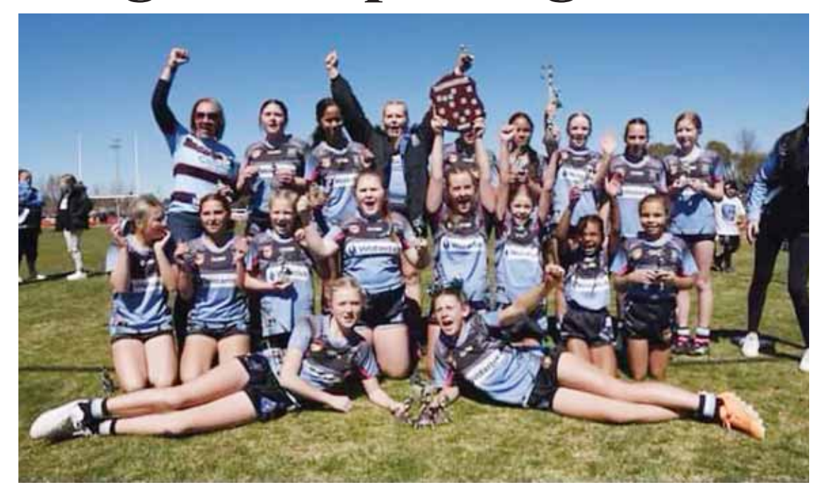
The Guyra Intermediate Leaguetag team are among a number of Guyra teams and individuals who have been nominated for the New England Sports Awards

The Hockey New England under 13 boys Indoor Hockey squad (division one state champions), the Hockey New England under 15 boys Indoor Hockey squad (division one state champions), PLC Junior IGSSA Hockey squad IGSSA (Junior champions), NEGS under 15 girls Hockey squad (premiers), the Hockey New England under 15 girls field Hockey squad (division 2 Hockey squad), TAS year 9 Quad Coxed Sculls (division 5 winners in Rowing of the Kings/PLC Regatta), Easts under 15 cricket squad (premiers), Servies under 13 cricket squad (undefeated premiers), the Armidale and District under 15 girls rep Netball squad, the Level boys Gymnastics NSW (Country champions), the TAS under 14 Girls Rugby Union Squad (North West champions), Uralla Central School's under 16 boys Touch Football squad (small schools State champions), the Guyra Intermediate girls League Tag Group 19 Rugby League squad (Premiers), the TAS number 2, 3, 4 and number 6 Armidale and District Netball squads (all 2023 Premiers), the Guyra Junior Polocrosse club (winners of the Guyra Junior Polocrosse carnival), the South Armidale Sonics under 16 boys Football squad the Sonics (undefeated premiers 2023).