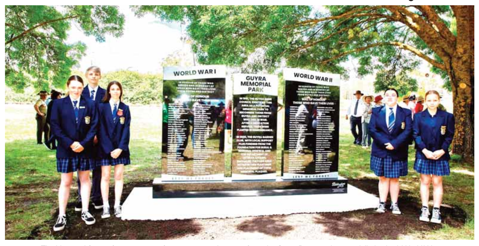
The Memorial Stones feature names of service men and women from the Guyra District who were killed in both World Wars

Seventy two years after it was first envisaged the Memorial Park in Guyra is now complete.