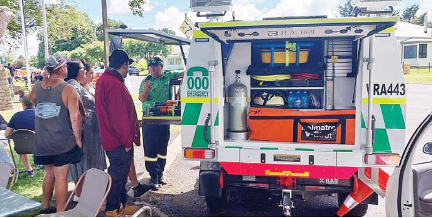
Above: The VRA are always here to help Below: Antique Machinery Rally Below right: A great music program has been organised

Below: Dining out at the Festival Don't miss out on a great Lamb Meal!