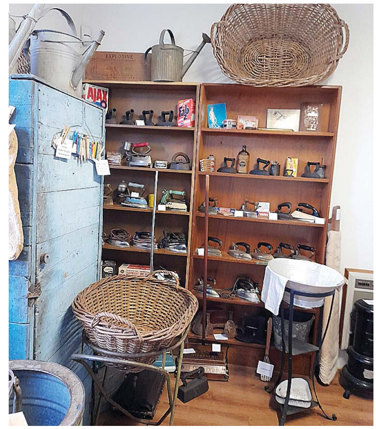
The revamped Laundry Room at the Museum with an amazing iron collection

The museum will be open this coming Friday 26th, Saturday 27th and Sunday 28th from 10am 3pm. On Friday 26th Australia Day morning tea will be served at the Museum from 9.30am.