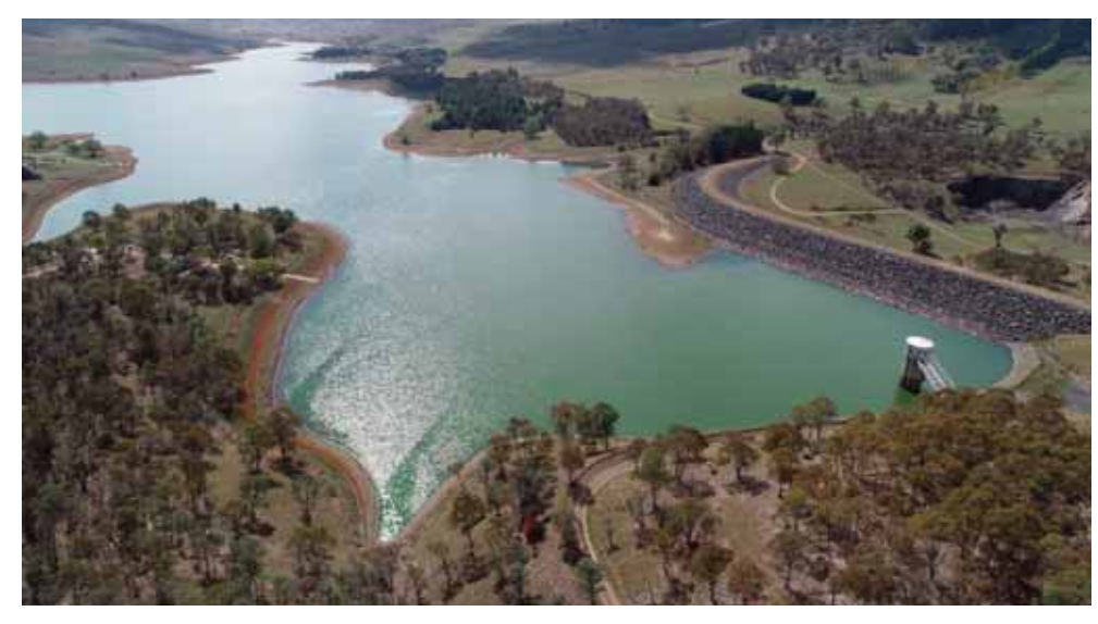
Total dam storage in the Armidale Region has fallen below the trigger point of 90%

Level 1 water restrictions involve households