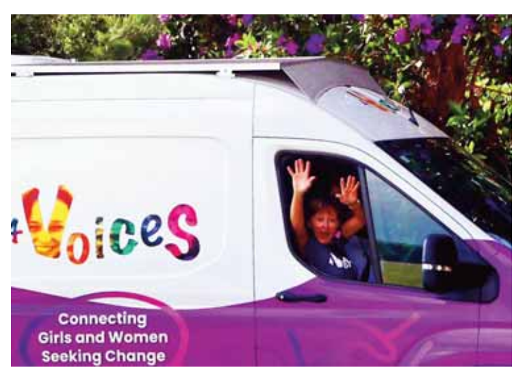
Look out for the purple van that will be in Guyra on Saturday, March 16th

That's why 4 Voices has launched the 40 towns, 4,000 connections campaign, to broaden its network across Queensland and New South Wales, united in the challenge to re-