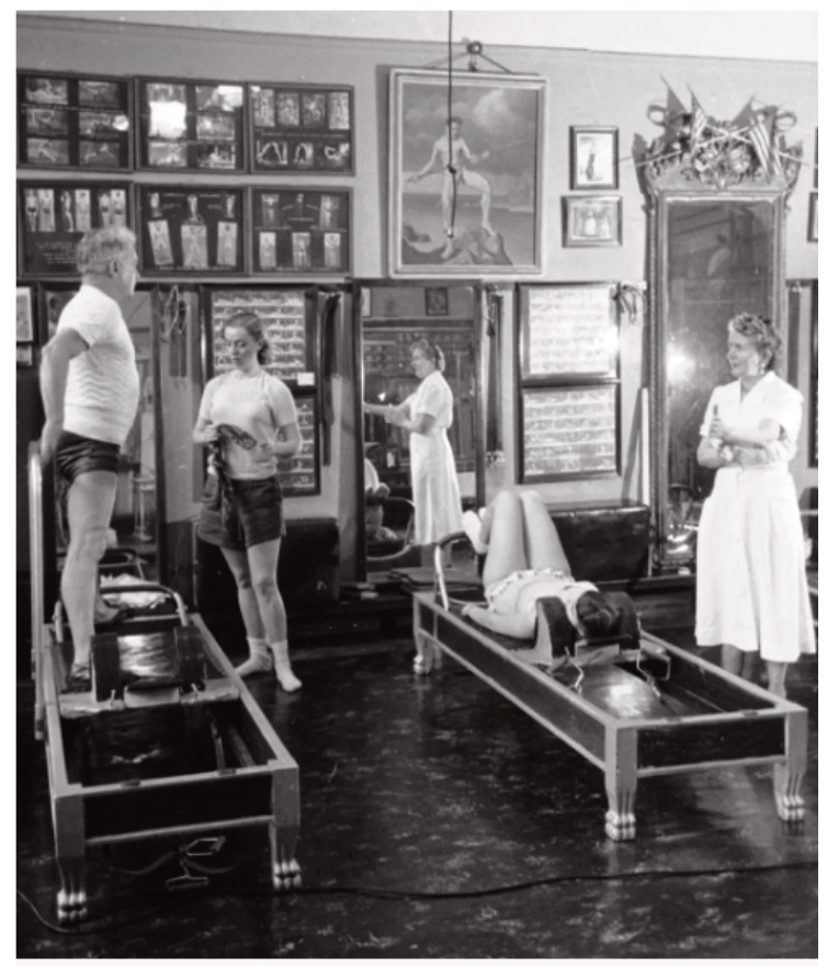
Joseph Pilates developed a regimen of muscle strengthening through slow and precise stretching and physical movements to assist rehabilitation of bedridden internees

Blood Banks: - Doctors rarely performed blood transfusions prior to Word War I. However, following the discovery of different blood types and the ability of refrigeration to extend shelf life, Captain Oswald Robertson, a US Army doctor consulting with the British Army, established the first blood bank in 1917 on the Western Front. This enable to have a blood supply as close to the front as possible for wounded patients. To facilitate storage, blood was kept on ice for up to 28 days and sodium