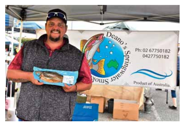
Deano's -Best Camping and Fishing experience in NSW

ing their dream home, selling their property or property management. Every interaction and every transaction are guided by our dedication to exceeding expectations and delivering exceptional results.