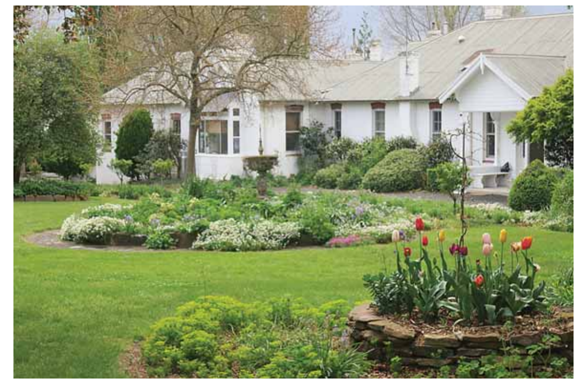
The Ollera garden was last open to the public in 2012

"We cannot thank Lynda and the Skipper family enough for opening their beautiful historic