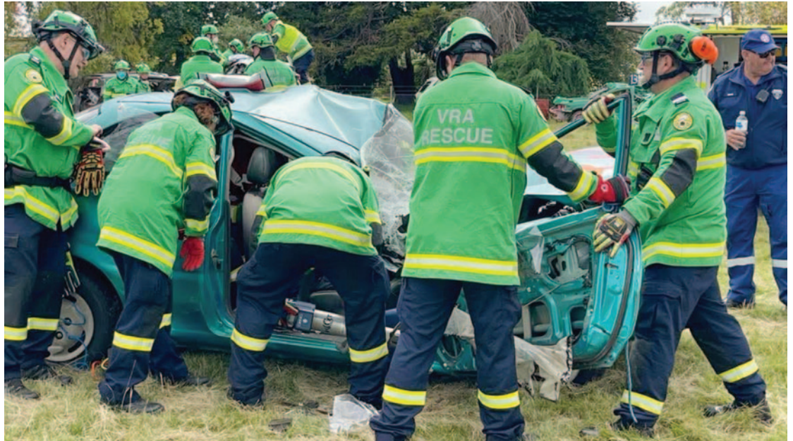
Realistic scenarios provided hands on experience for participants

A major focus was on modern extrication techniques using advanced hydraulic and battery-powered tools. Participants trained with Holmatro's Pentheon series, battery-powered Lukas and Weber Rescue