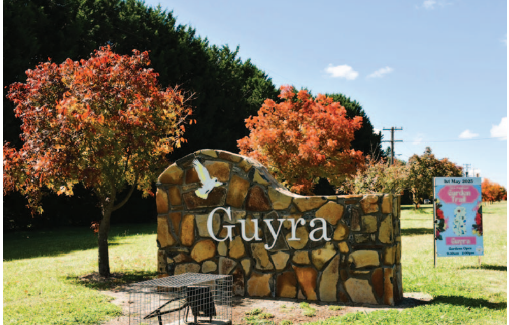
Three Guyra Gardens will be open on May 1st

Before the Garden Trail commences, visitors are also welcome to visit Walcha on Monday just