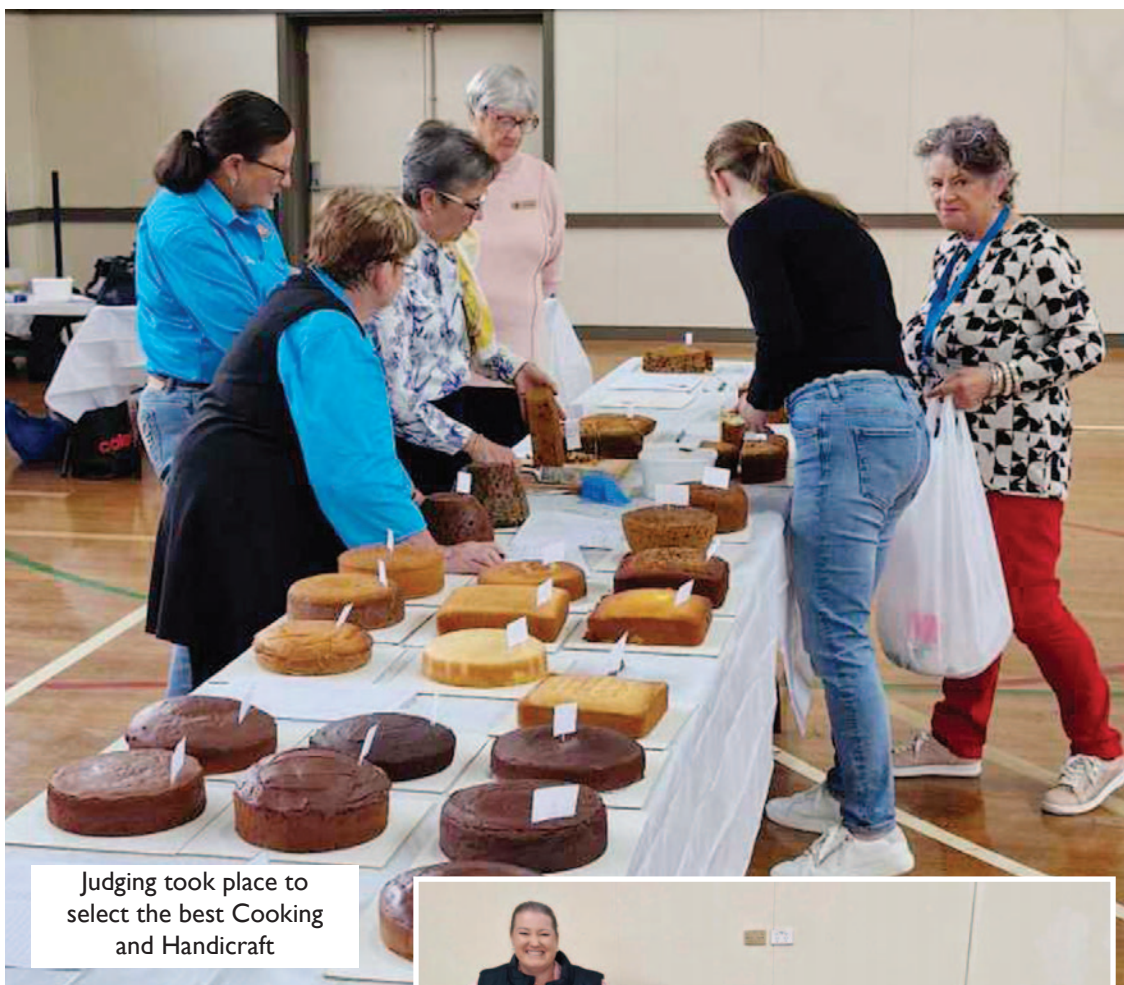
Judging took place to select the best Cooking and Handicraft

From sign in table, raffles, delegates, kitchen helpers, set up and pack down our branch, as always had a fabulous day meeting new friends and catching up with old. Recipes were swapped, congratulations given to those entries heading to CWA NSW State Conference in May at Wagga Wagga and learning more about the ins and outs of