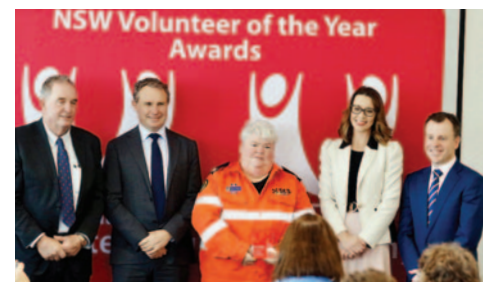
The New England and Northern Inland NSW Volunteer of the Year Awards honoured some of the region's selfless and dedicated volunteers.