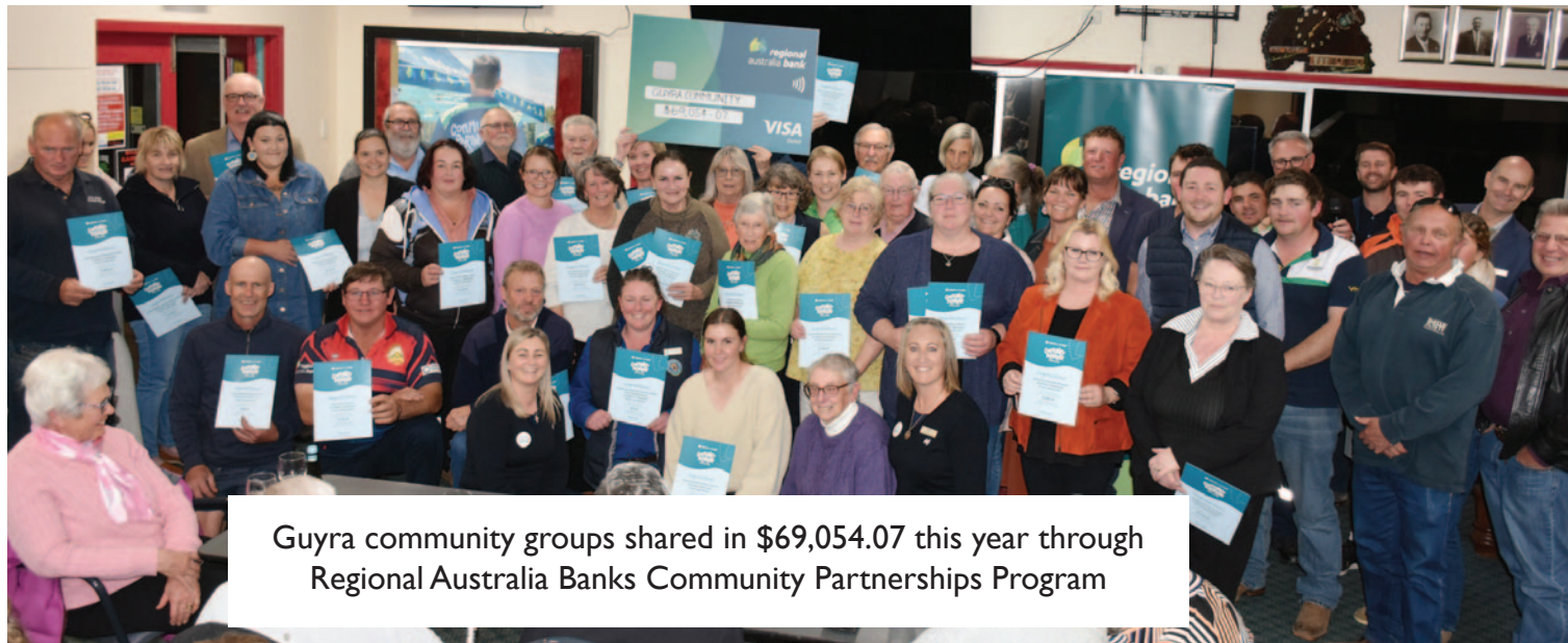
Guyra community groups shared in $69,054.07 this year through Regional Australia Banks Community Partnerships Program

The Guyra community came together to celebrate Regional Australia Banks Community Partnership Program (CPP) last week. The evening highlighted the strength of local organisations, the generosity of Regional Australia Bank, and the commitment of community groups making a difference every day.