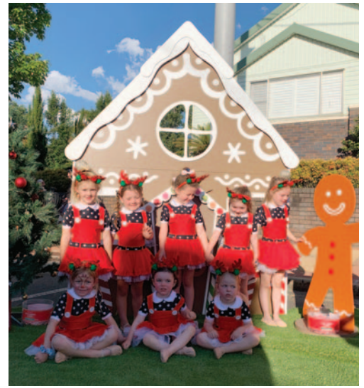
Tiny dancers from Australian Dance Enterprises