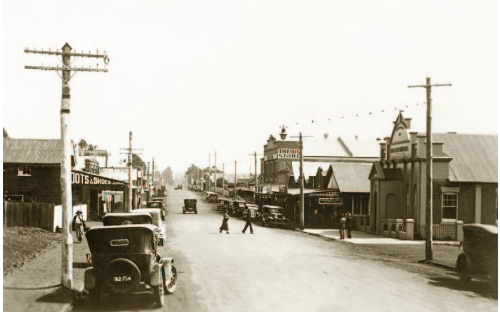
Above: Bradley St, Guyra 1934

For weeks prior to the great day preparations are made for the festive season. Homes are made beautiful, shops are decorated with gay