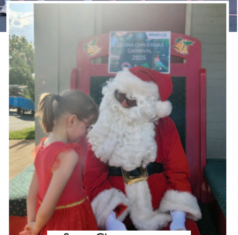
Santa Claus, presents and train rides were a hit with the kids