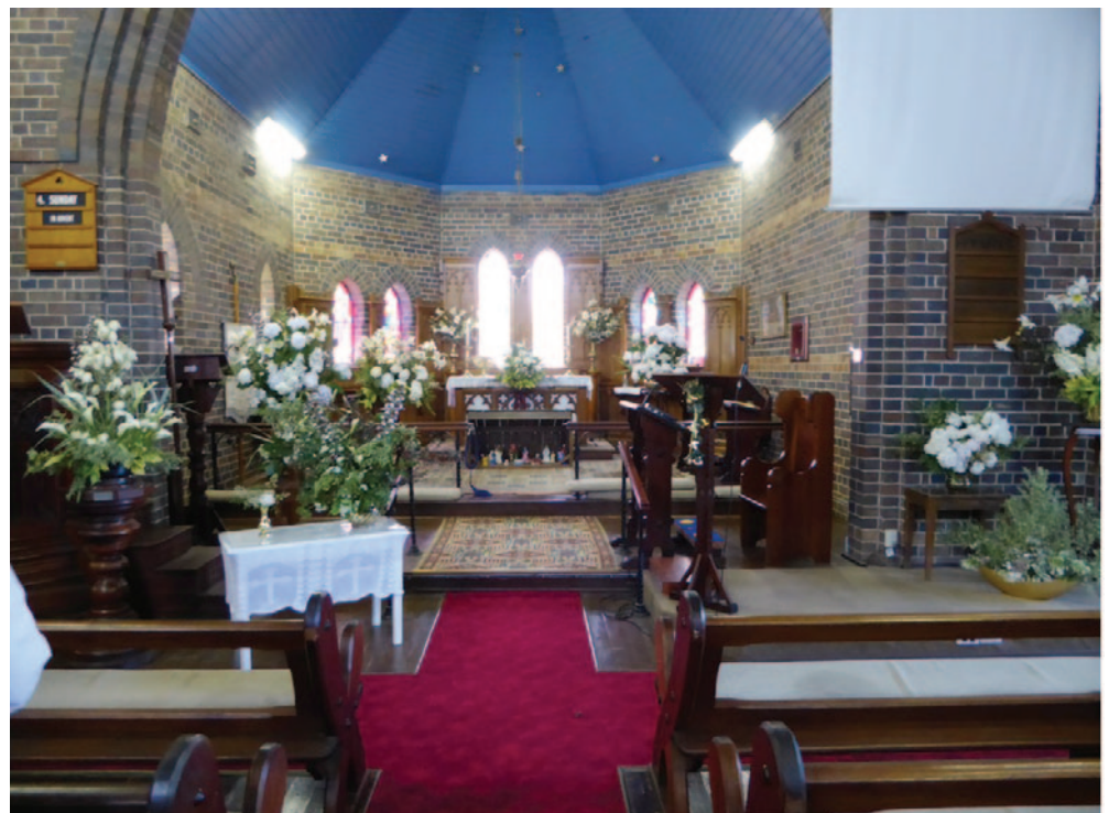
Below: Ready for Christmas at Guyra Anglican Church

paper garlands, Christmas bells and balloons and delightful toys are displayed in the windows.