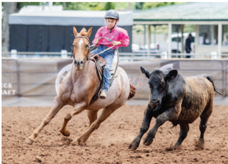
Guyra Campdraft Club is building for the future