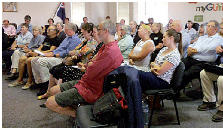
The Guyra Council chambers were packed to hear the positive message about urban renewal

The Renew organisation secures short term, low or nil cost commercial space. Usually in empty shops. They help an entrepreneur prepare the premises; assist with local and state government regulations and cover some costs including insurance. The new businesses have access to the shop until a commercial tenant is found by the landlord. While many businesses fail, some succeed and go onto sustaining themselves in the market place.