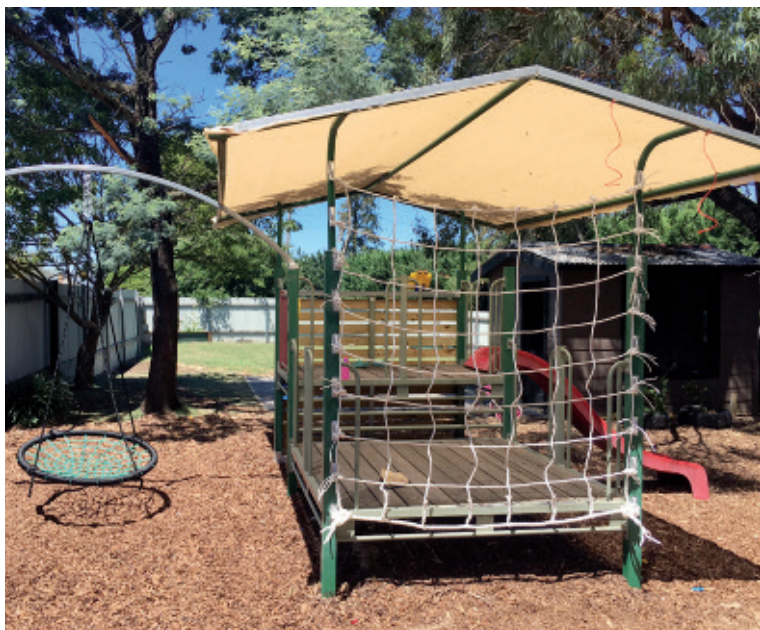
The overhaul of the backyard at the Guyra Preschool is progressing with the old fort (above) now rejuvenated and the area under the trees transformed from bare dirt to green (below)